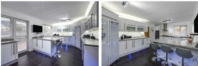
Kitchen / Diner 20'11" x 12'0" (6.38m x 3.66m )

Upvc double glazed door leading to the rear external with side window, two Upvc double glazed windows, central heating radiator, tiled flooring and fitted with a range of white floor and eye level units, contemporary worktops with splashback tiles above, sink with mixer tap, breakfast bar and a host of integrated appliances including double oven and microwave, hob with extractor hood above, two fridges, washer / dryer and American fridge-freezer.