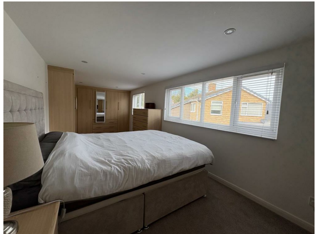
Bedroom One 20'6" x 8'2" (6.25m x 2.51m )

Two Upvc double glazed windows to the rear elevation, central heating radiator and fitted wardrobes.