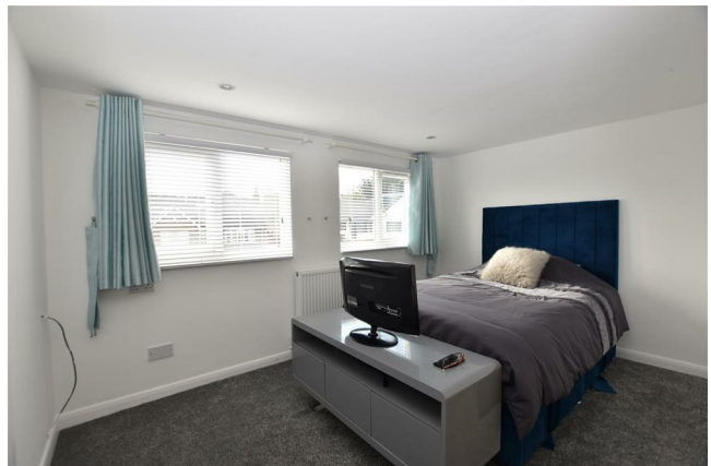
Bedroom Three 12'0" x 8'7" (3.66m x 2.64m )

Two Upvc double glazed windows to the front elevation, central heating radiator and fitted wardrobe.