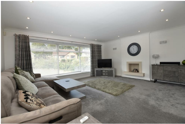
Lounge 17'8" x 15'8" (5.41m x 4.78m )

Two Upvc double glazed windows, two central heating radiators and contemporary wall mounted fire.