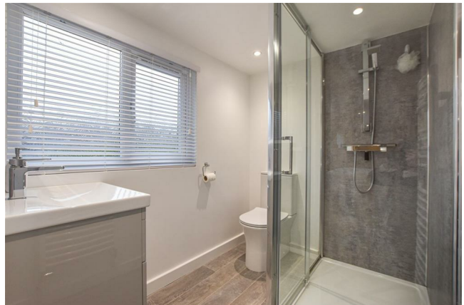
En-Suite 6'7" x 5'2" (2.03m x 1.60m )

Upvc double glazed window to the rear elevation, central heating radiator, partly tiled to splashback areas, storage in the eaves, cushion flooring and fitted with a three piece suite comprising walk in enclosure with mixer shower, vanity sink with mixer taps and low flush W.C.